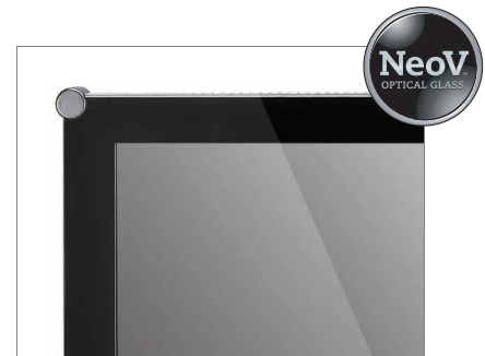
NeoV™ Optical Glass for hard glass protection and strong metal casing for secure mounting